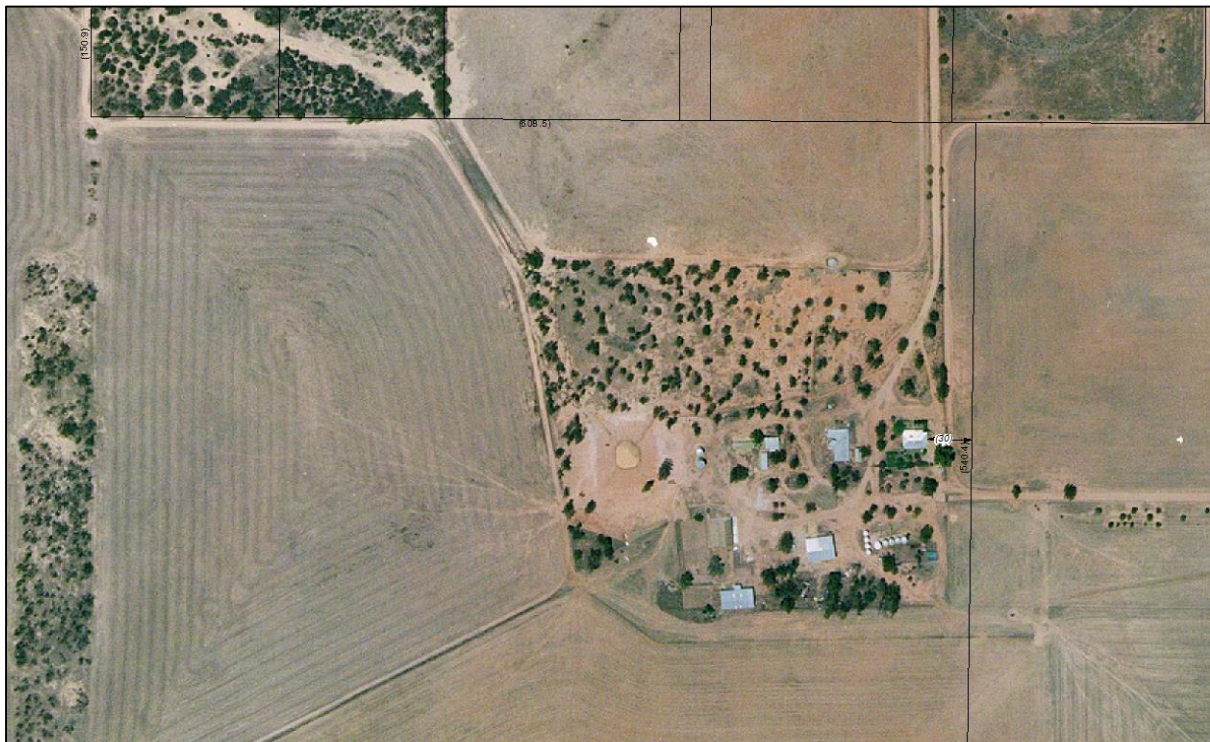
FIGURE 2 – SITE IMPROVEMENTS