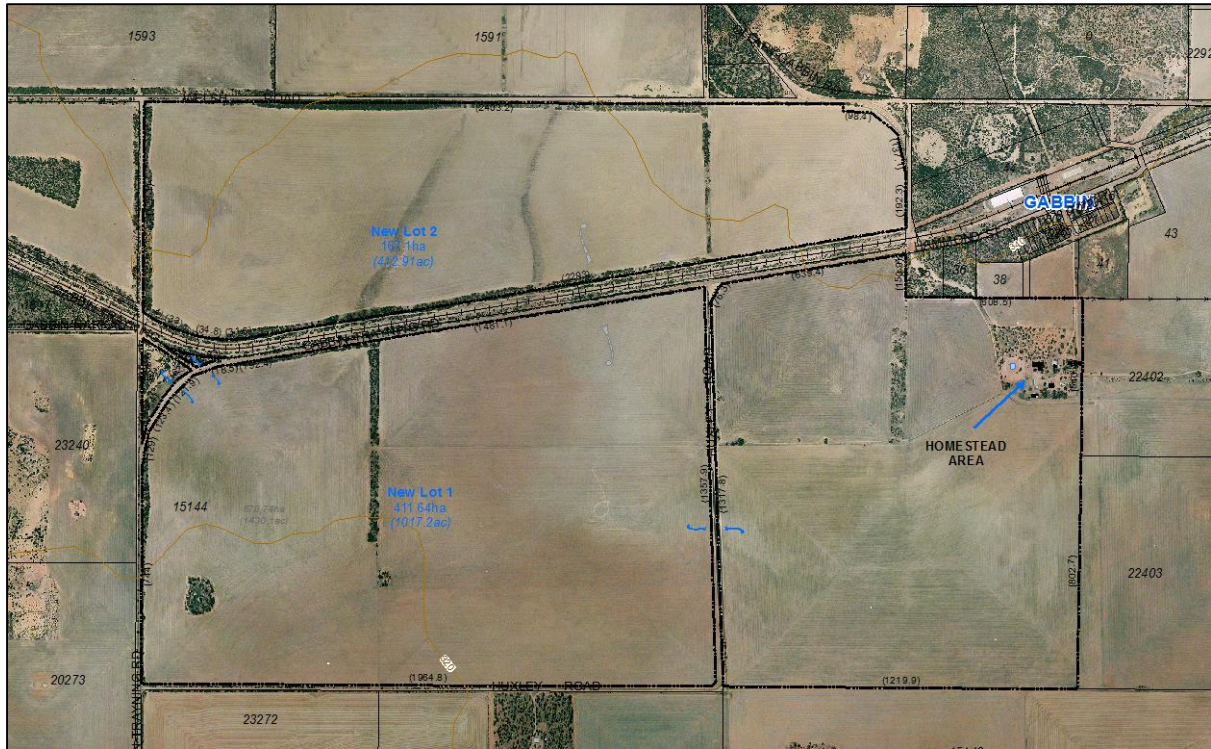
FIGURE 3 – AERIAL PHOTOGRAPH OF PROPERTY

The land is currently zoned 'Rural' in the Council's Local Planning Scheme No 3; with the whole property currently used for farming purposes - as can be seen from Figure 3 .