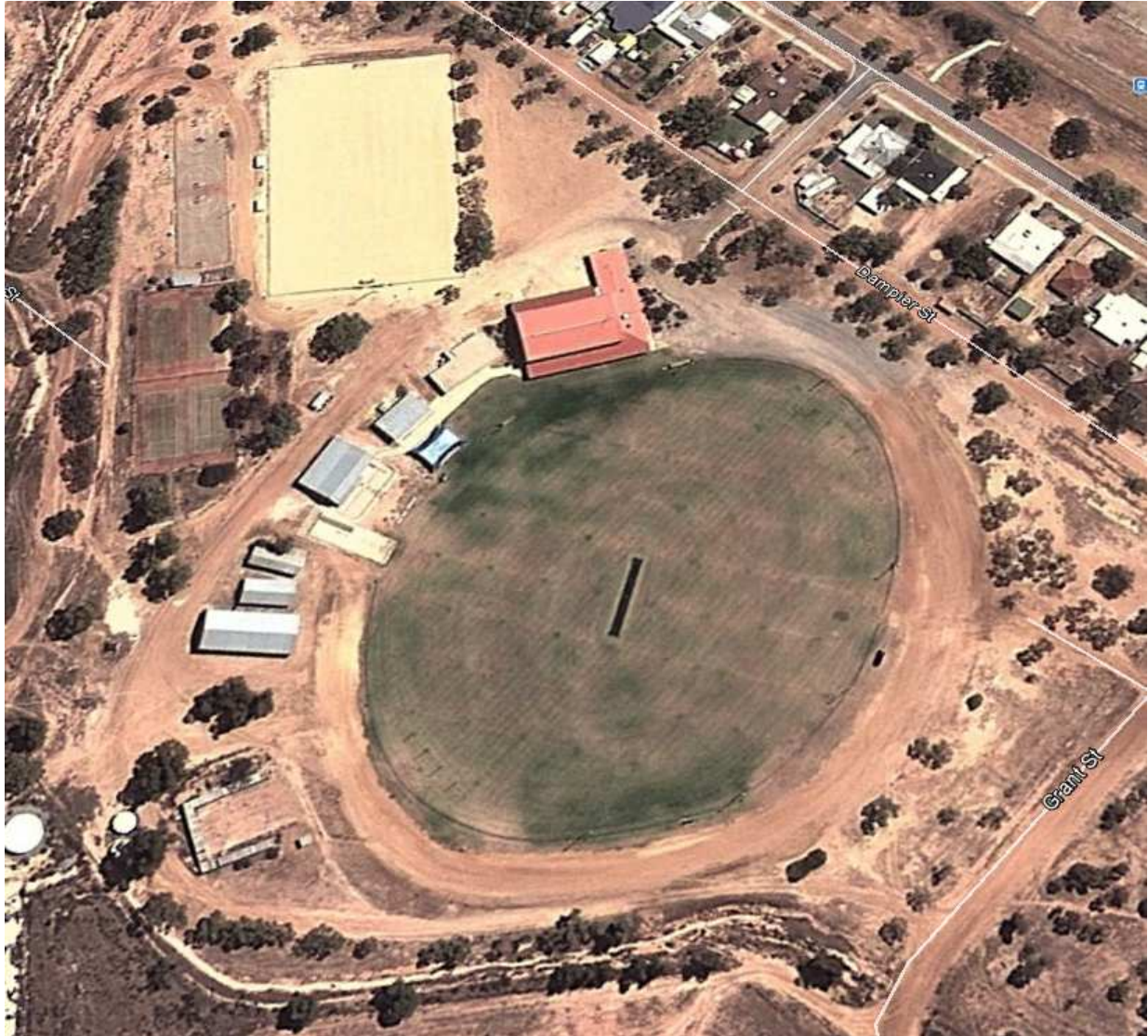
Above: Bencubbin Sporting Complex and Town Oval

The Development of a Sports and Recreations Master Plan document would involve and encourage a large amount of community input and feedback from clubs, associations, teams and individuals. This process would include public meetings, surveys and in person meetings with the selected consultant during the development of the plan to ensure that as much information as possible is gathered. This is essential for the development of an accurate and workable master plan which truly reflects the needs and wants of the Mt Marshall sporting and recreational community.