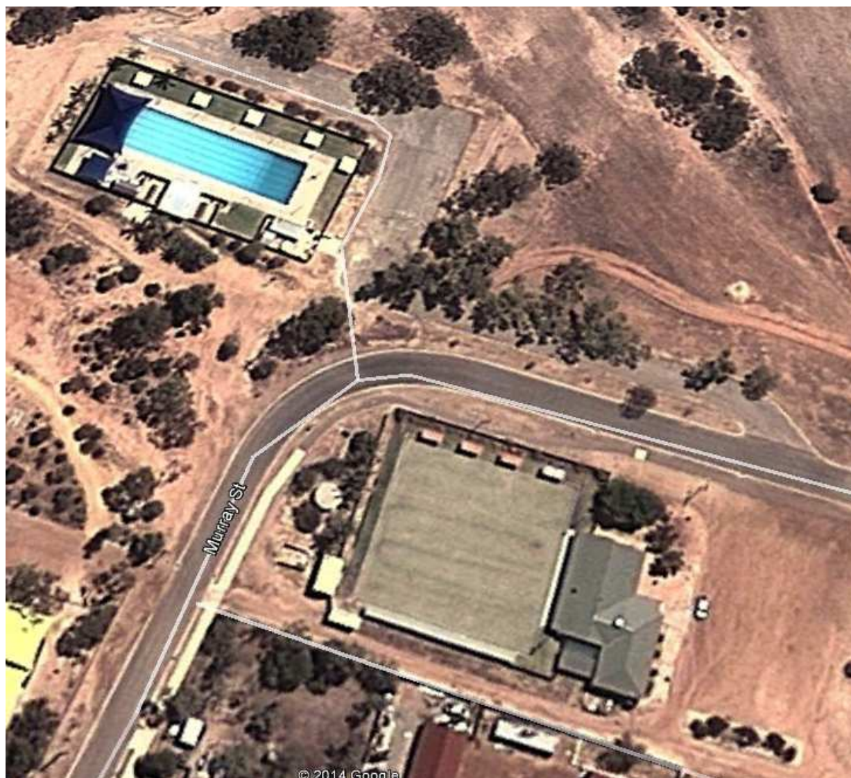
Above: Bencubbin Aquatic Centre and Sporting Club