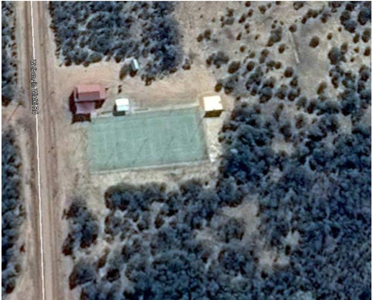
Above: Welbungin Hall and Tennis Club.