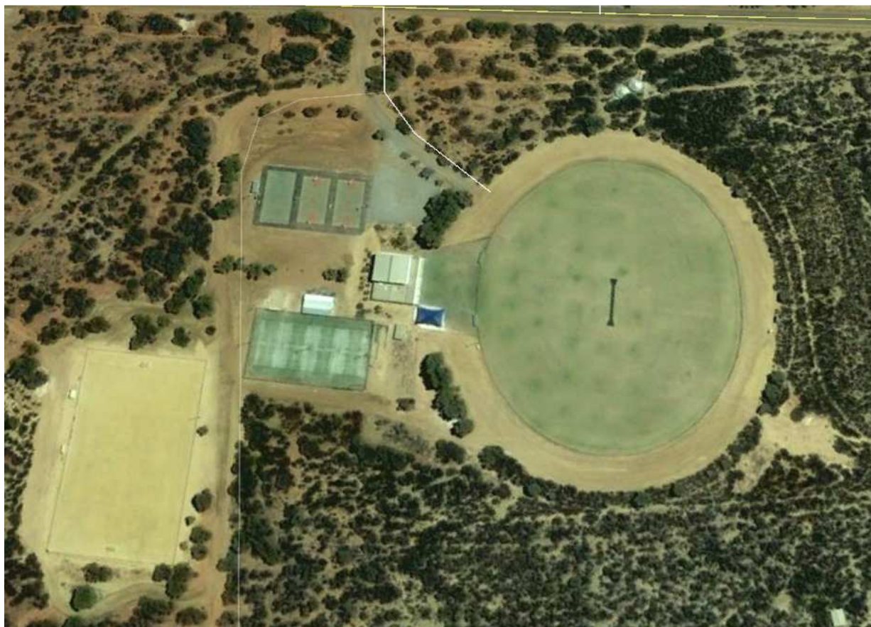
Above: Beacon Sporting Complex and Town Oval.