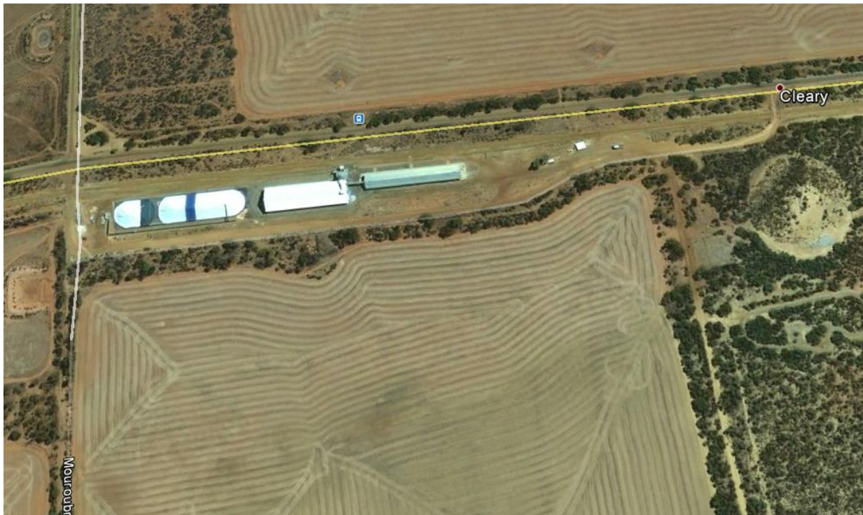
Above: Cleary site