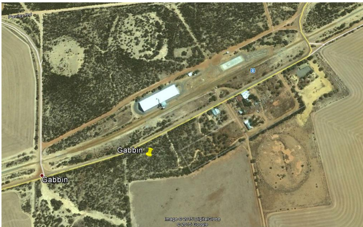
Above: Gabbin site