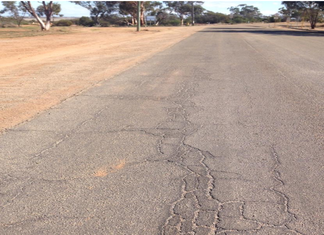
Above: Pavement of section in poor condition, severe cracking obvious.