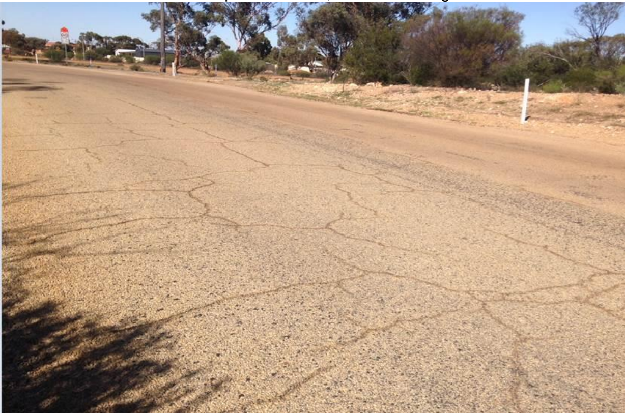
Above: Cracked road surface