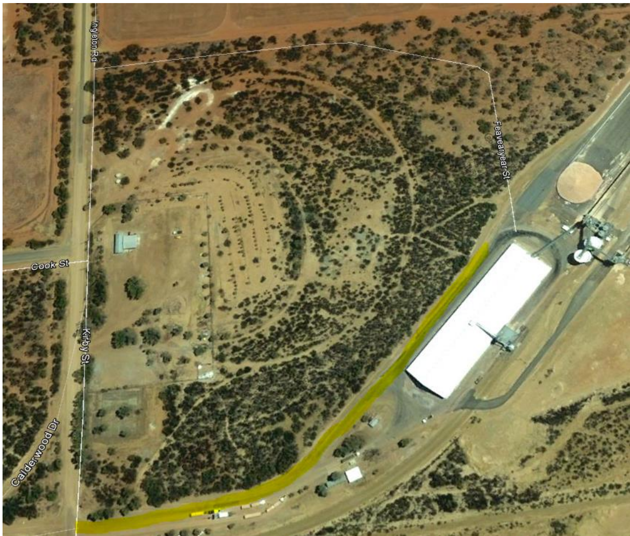
Above: Beacon site