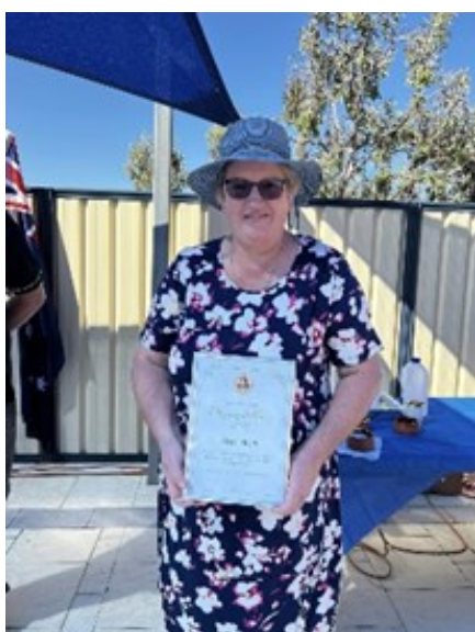
Citizen of the Year 2023