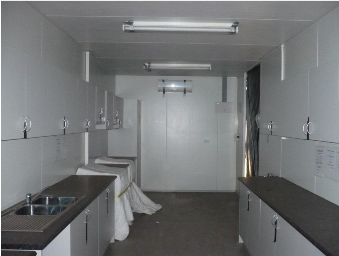
Above: Camp kitchen interior.