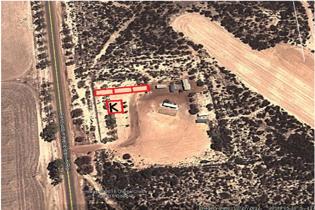
Above: Proposed Workers Camp facility shown in Red, K represents Kitchen.

Photos of the proposed facility follow however may vary slightly from the final product.