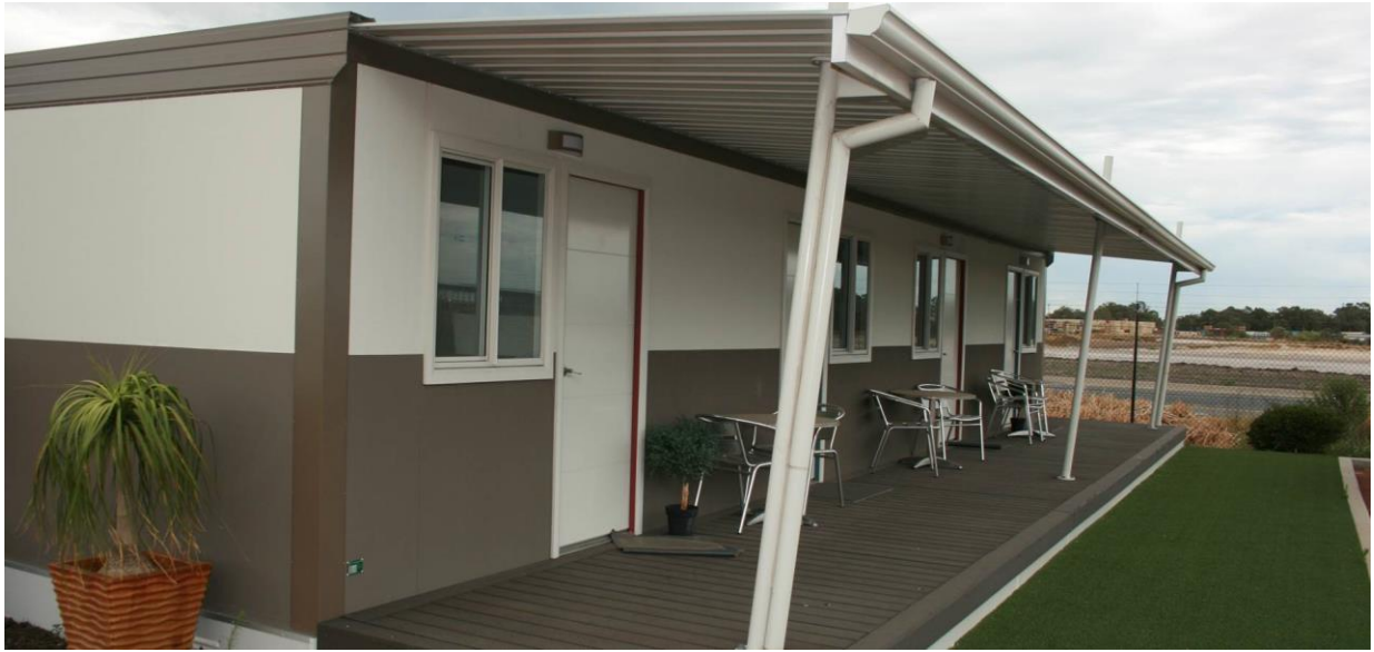
Above: Rooms and Veranda (high specification rooms shown)