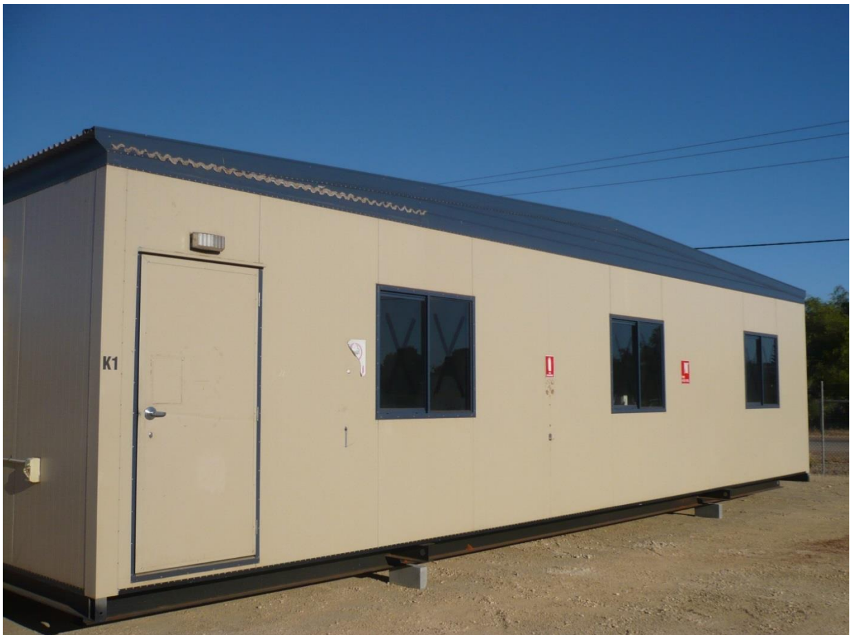
Above: Camp kitchen exterior.

Photos of the proposed facility follow however may vary slightly from the final product.