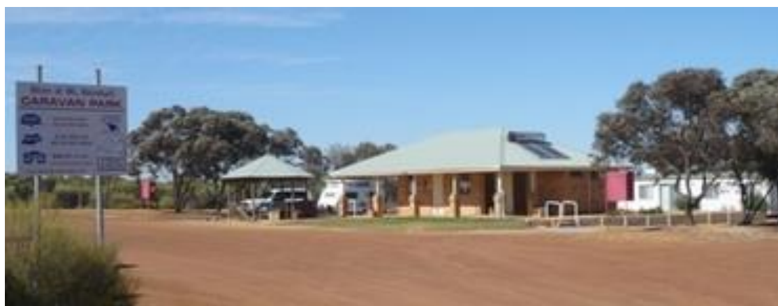
Above: Beacon Caravan Park

The CEO is not aware of any expressions of interest that may be forthcoming, however believes that advertising the opportunity is worthwhile to accurately determine interest.