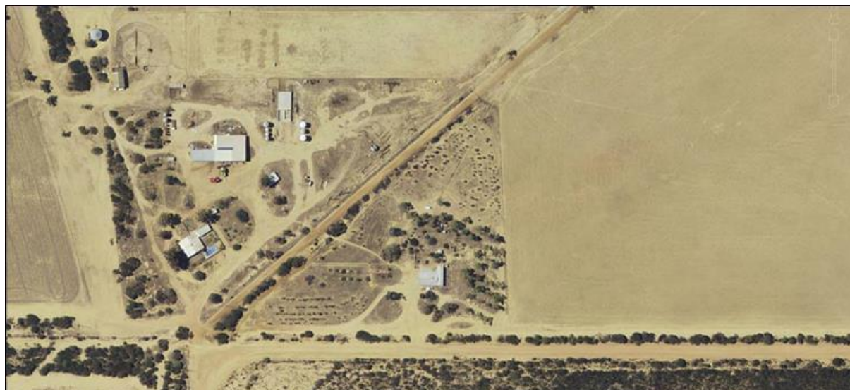
FIGURE 2 – SITE IMPROVEMENTS