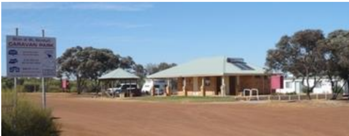
Above: Beacon Caravan Park

The CEO is not aware of any expressions of interest that may be forthcoming, however believes that advertising the opportunity is worthwhile to accurately determine interest.