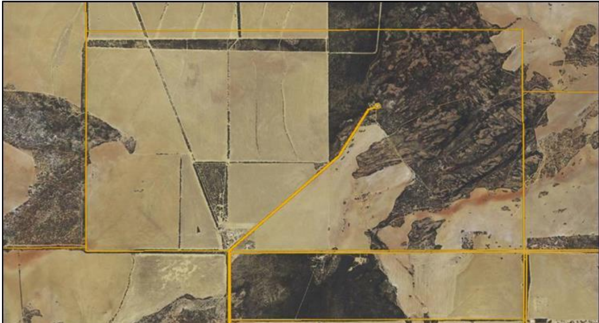
FIGURE 3 – AERIAL PHOTOGRAPH OF PROPERTY