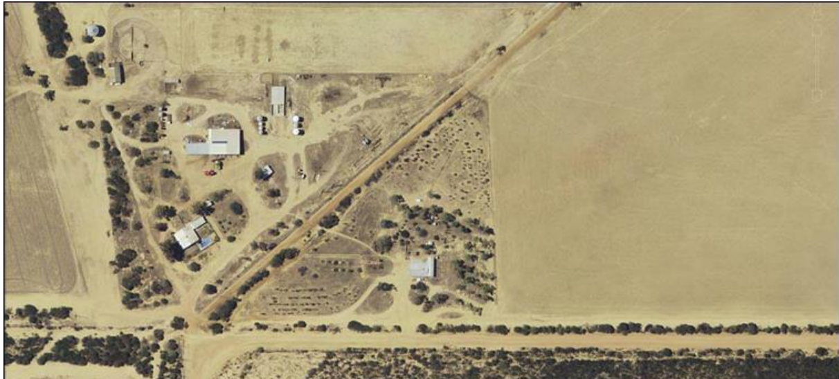
FIGURE 2 – SITE IMPROVEMENTS