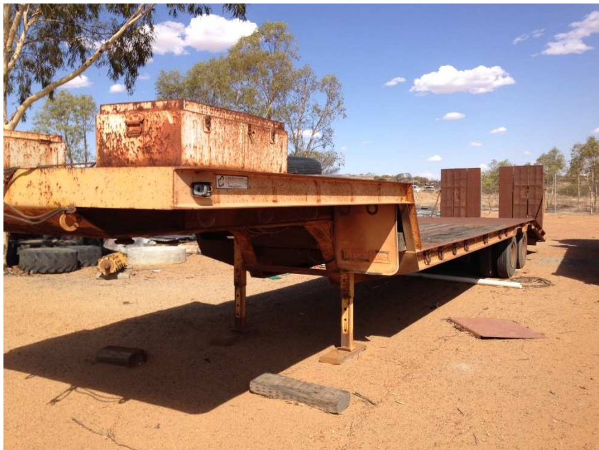
Above: 1982 Tandem Axle Float