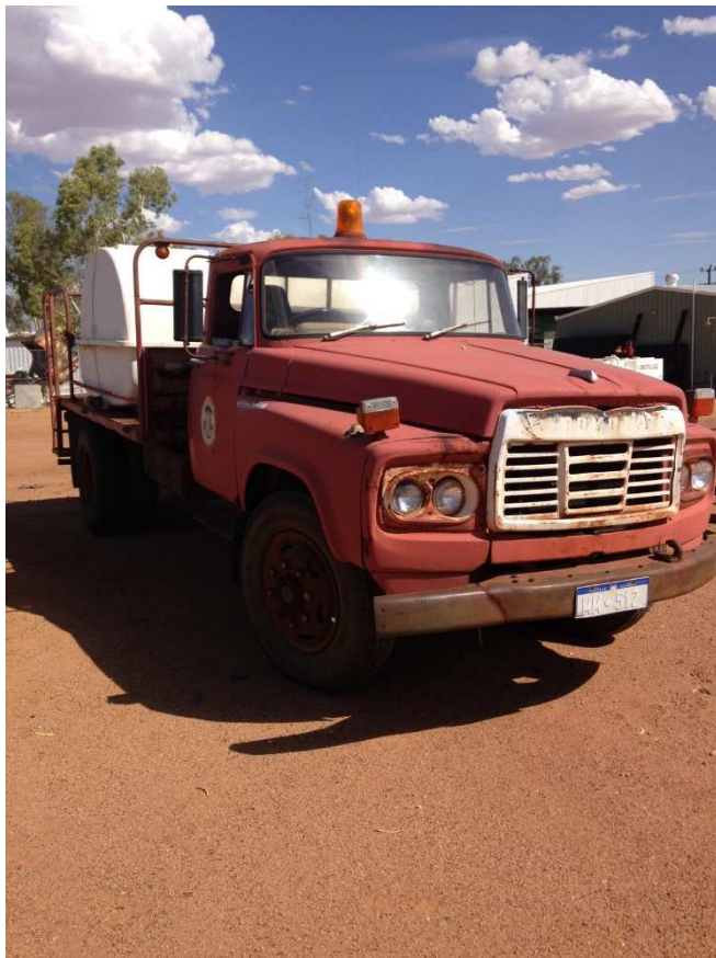
Above: 1976 Toyota Truck

Photos of various items included in the proposed tender are listed below and other minor items will be added as the need arises.