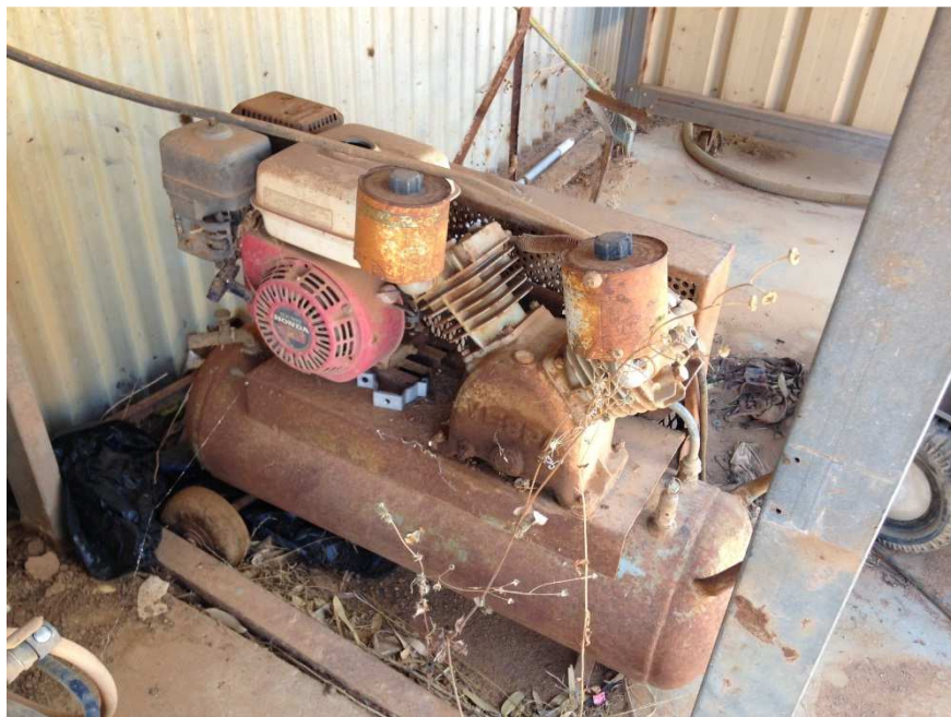
Above: Petrol Air Compressor