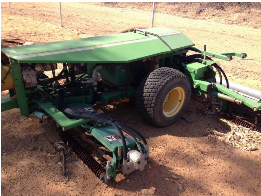
Above: 2001 John Deere Gang Mower (unit 1 of 2)