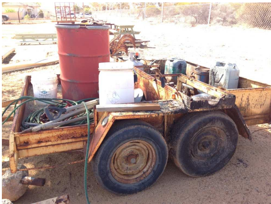
Above: Old Bitumen Trailer