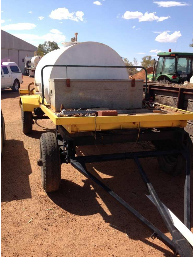
Above: Unlicensed Fuel Trailer – approx. 4000ltrs.