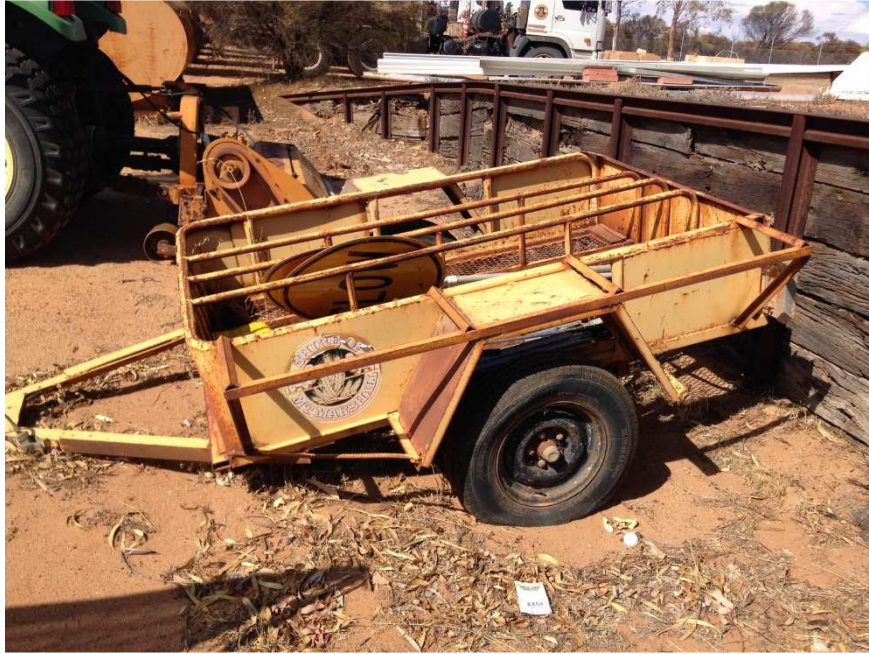
Above: Old Sign Trailer