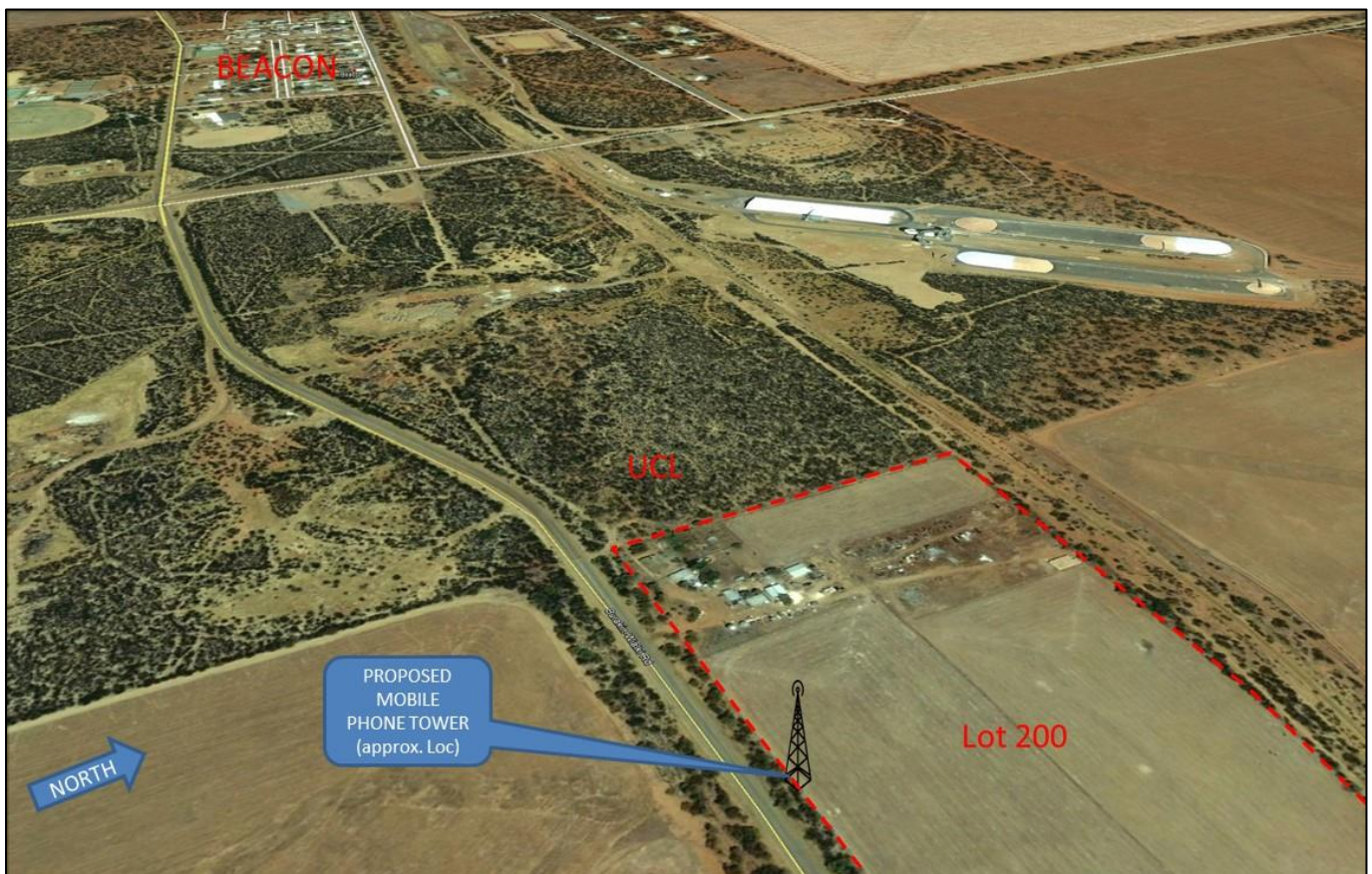
FIGURE 1 – LOCATION PLAN

The subject land (Lot 200) is owned by J and R De Jong and measures just over 18 hectares. The majority of the land is currently used for rural purposes. The dwelling is set amongst a group of other buildings, mostly clustered around the south west part of the property. Figure 1 provides an oblique view of the property indicating the lot's relationship to the Beacon townsite. The Tower is shown diagrammatically (not to scale) to indicate the approximate location in respect to the buildings on the land.