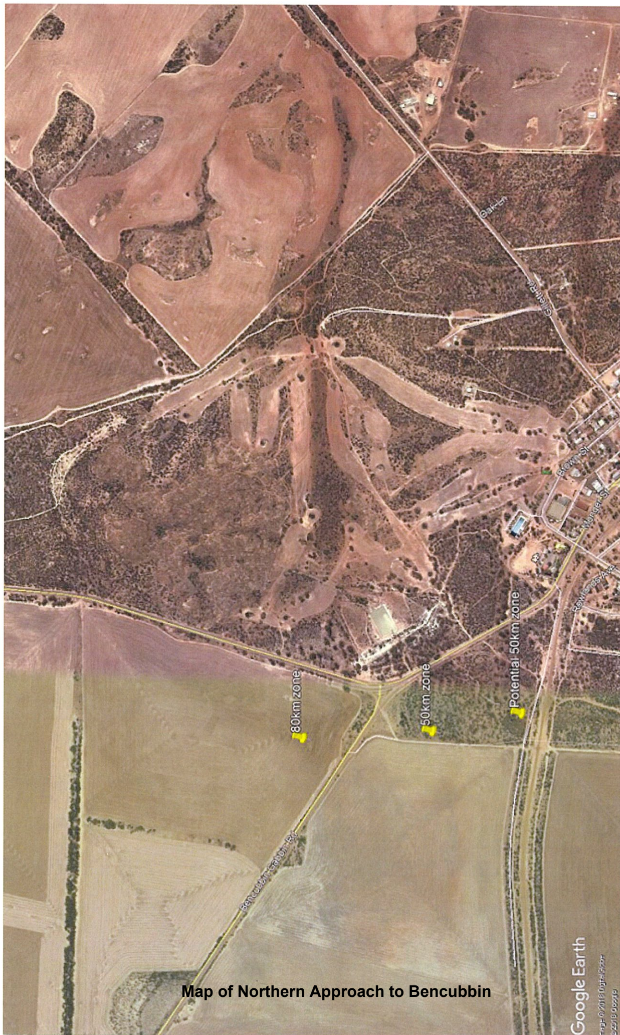
Map of Northern Approach to Bencubbin